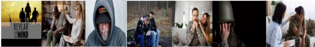
TBI/PTSD Veterans can finally be treated with something different than off-label prescription medications! Could this be you?

Have you been knocked unconscious in combat, exposed to IEDs, explosions, or sexually assaulted? Are you suffering from routine migraine headaches, sensitivity to light, having memory issues, trouble finishing sentences, difficulty expressing thoughts, self medicating? If so, you are only one of over an estimated 877,450 TBI/PTSD Veterans across America suffering from TBI/PTSD in the same manner.